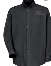
MEN'S MERIDIAN PERFORMANCE TWILL SHIRT SHORT SLEEVE: 1T22 / LONG SLEEVE: 1T12 COLOR: BLACK (BK), WHITE (WH) 1T12BK SHOWN