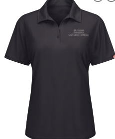
PERFORMANCE KNIT® FLEX SERIES WOMEN'S PRO POLO / SK91 COLOR: BLACK (BK), GREY (GY), WHITE (WH) / SK91BK SHOWN