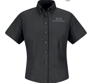
WOMEN'S MERIDIAN PERFORMANCE TWILL SHIRT SHORT SLEEVE: 1T21 / LONG SLEEVE: 1T11 COLOR: BLACK (BK), WHITE (WH) 1T21BK SHOWN