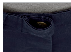
Covered Waistband Button