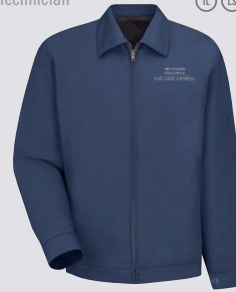
SLASH POCKET JACKET JT22NV COLOR: NAVY (NV)