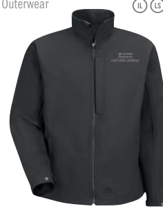
SOFT SHELL JACKET JP66BK COLOR: BLACK (BK)