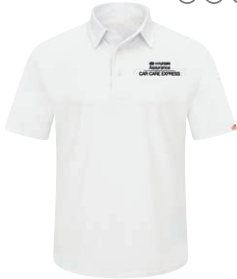
PERFORMANCE KNIT® FLEX SERIES MEN'S PRO POLO / SK90 COLOR: BLACK (BK), GREY (GY), WHITE (WH) / SK90WH SHOWN