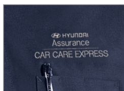
Left Chest Logo